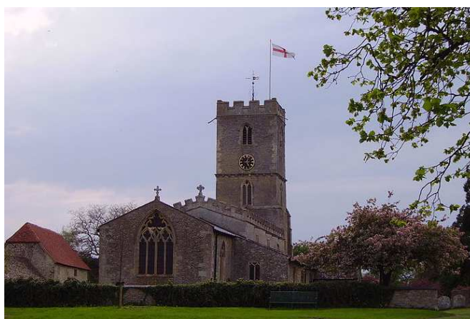
St. Denys parish church, Stanford in the Vale

He was christened Christmas Day 1867 in Stanford in the Vale.