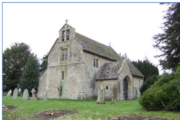
Faringdon parish church