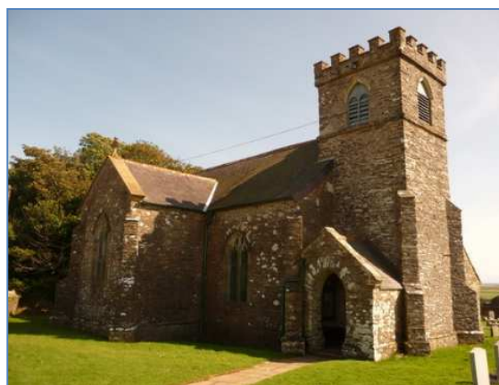
Buckland parish church