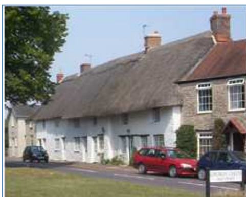
Stanford in the Vale