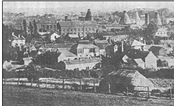
Wordsley in the parish of Kingswinford