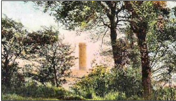
Beacon Tower, Sedgley