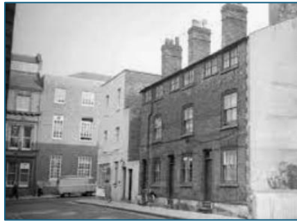
Woolpack Lane in Nottingham