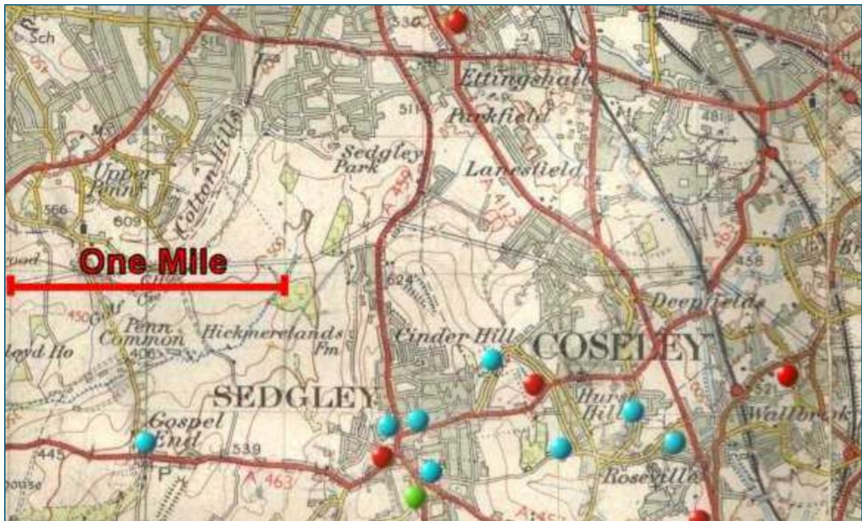
Map of Sedgley from www.sedgleymanor.com (Ettingshall is shown at the top of the map)