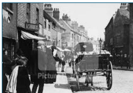
Charlotte Street in Nottingham

In 1861 the family was still living in Nottingham.