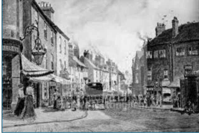
Milton Street in Nottingham