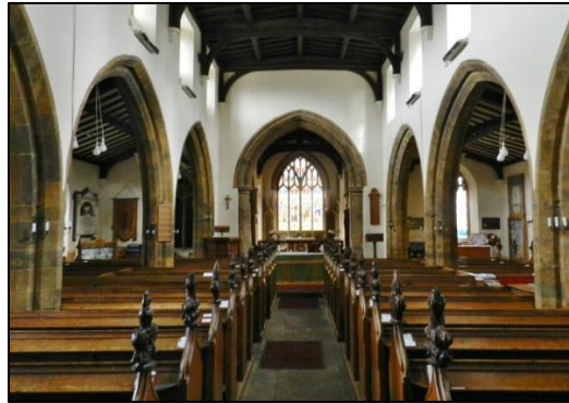
Interior of St. Johns church in Bodicote