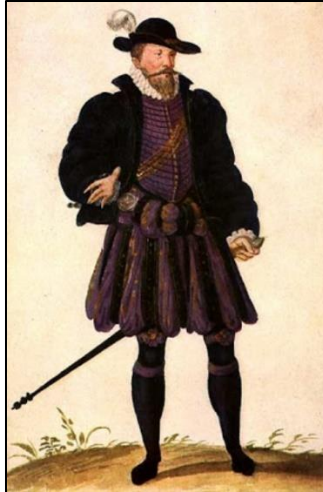
Elizabethan men's clothing