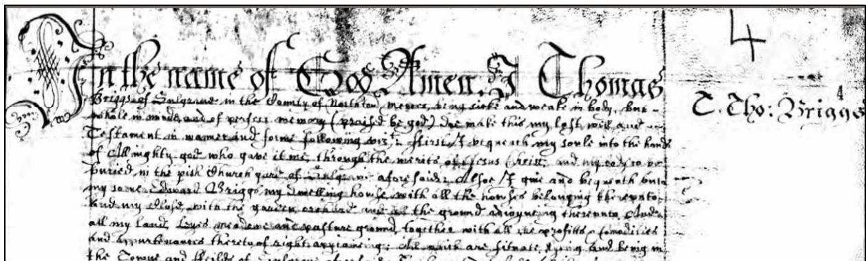
Will of Thomas Briggs of Sulgrave, 1653, PCC

Thomas died in about 1653 of Sulgrave, leaving a will.