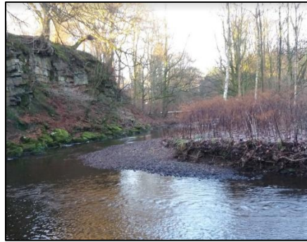
Harwood in Bolton parish