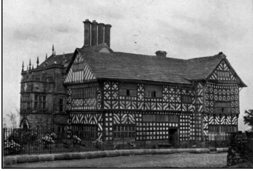
Hall i' th' Wood near Bolton (now a museum)