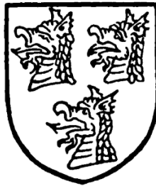
Longworth of Longworth. Argent three dragons' heads couped sable.

The Longworths of Longworth are mentioned in a history of Longworth: