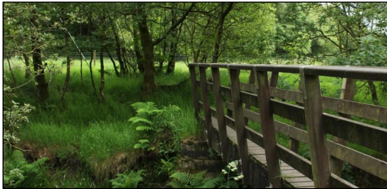
Longworth Clough, formerly part of the Longworth Hall estate