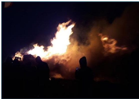
Bonfire on Knockfierna