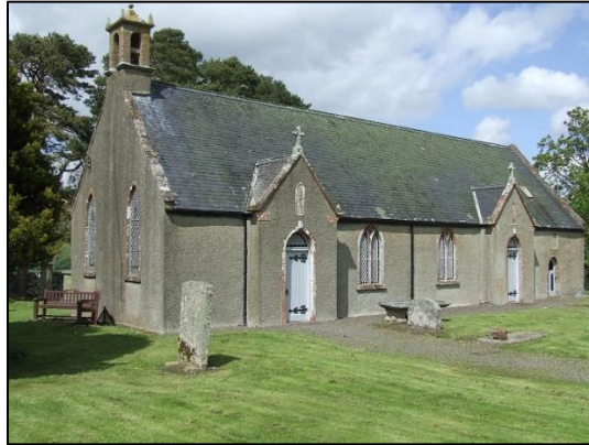
The church at Drumelzier