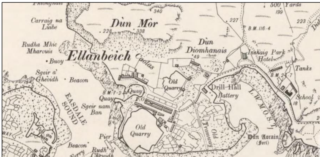
Map of Ellanbeich Caolas is shown in the center.