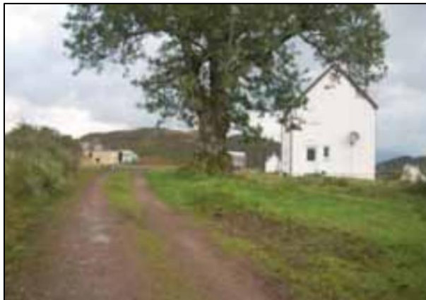
Laitt in Muckairn parish