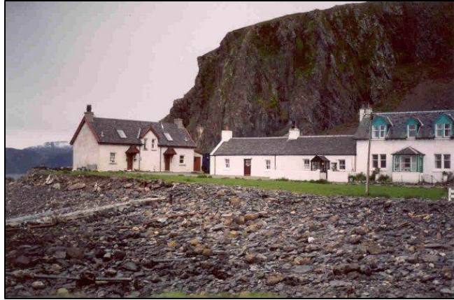
Caolas with the cliffs of Dun Mor in the background