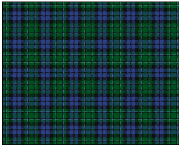
Clan MacCallum tartan